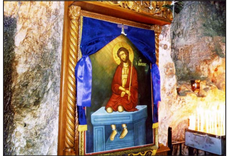
Icon of Jesus shackled in the Praetorium.

337 A.D. by St. Helen. We were welcomed by the Geronda who gave us a brief tour of the monastery, showing us the Burning Bush and Jethro's well where Moses met his wife Zipporah.