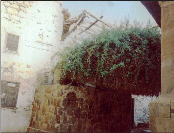
The Burning Bush at the Saint Catherine's Monastery.