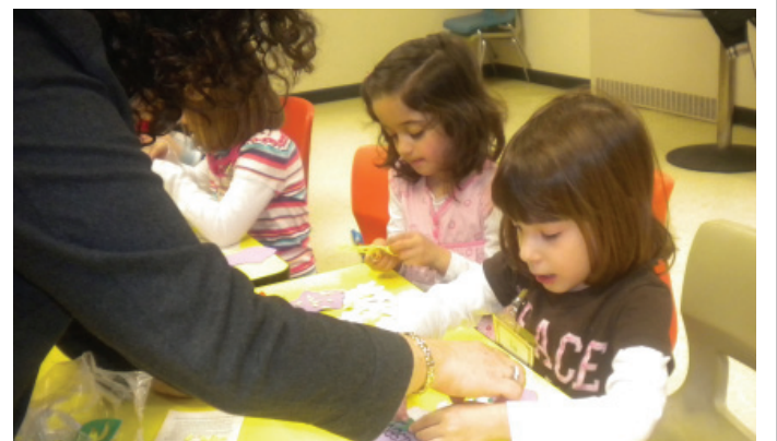
Bottom right: Parent volunteer helping a child make a craft during the J.O.Y. meeting about Easter.