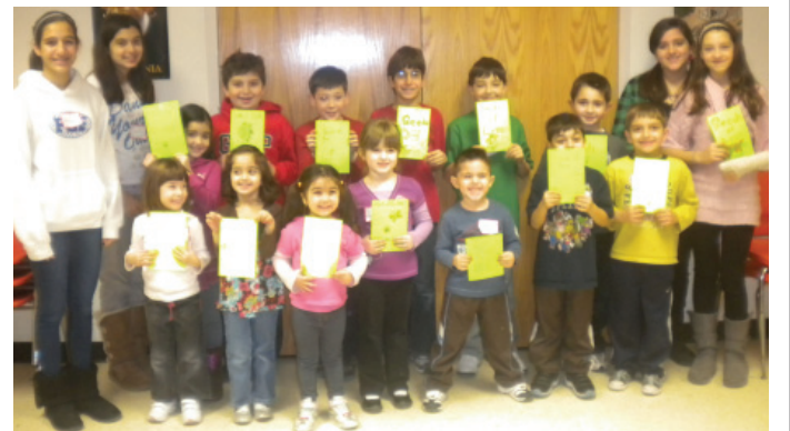
Top right: Children of St. Nicholas Parish displaying a card that they made at a J.O.Y. meeting about “sowing the seeds of love” through good deeds.