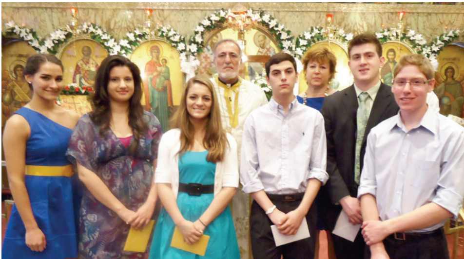
The Ladies of Philoptochos presented scholarship awards to deserving students.