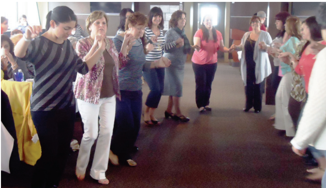
Parishioners and Friends Celebrated the 10th Anniversary of the Philoxenia House on the Spirit of Baltimore Cruise Ship.