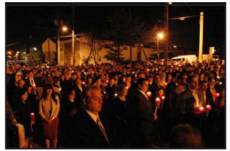
Parishioners sharing "the Light" in front of the church.