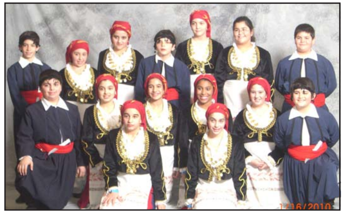
PICTURED ARE OUR AMAZING ELLINAKIA DANCERS WHO REPRESENTED ST. NICHOLAS CHURCH IN THE FOLK DANCE COMPE TITION IN ANNAPOLIS THIS PAST JANUARY.