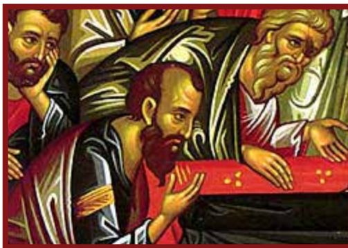
3. The Apostle Paul bows in honor of the Theotokos (detail).

Together with the Apostles are several bishops (4.) and women. The bishops traditionally represented are James, the brother of the Lord, Timothy, Heirotheus, and Dionysius the Areopagite. They are shown wearing episcopal vestments. The women are members of the church in Jerusalem.