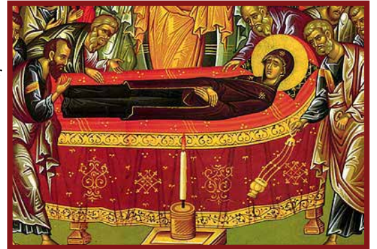
5. The Theotokos lies in the center of the icon surrounded by the Apostles and a candle in front of her bed (detail).

This great Feast of the Church and the icon celebrates a fundamental teaching of our faith—the Resurrection of the body. In the case of the Theotokos, this has been accomplished by the divine will of God. Thus, this Feast is a feast of hope, hope in Resurrection and life eternal. Like those who gathered around the body of the Virgin Mary, we gather around our departed loved ones and commend their souls into the hands of Christ. As we remember those who have reposed in the faith before us and have passed on into the communion of the Saints, we prepare ourselves to one day be received into the new life of the age to come.