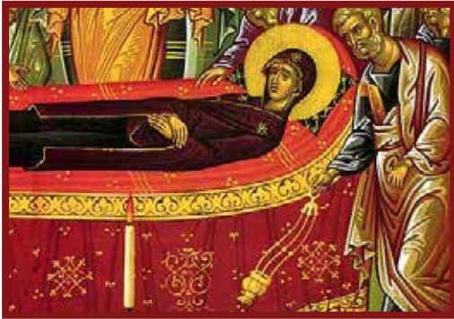
2. The Apostles bow their heads in reverence to the Theotokos as Saint Peter (right) censes her body (detail).

Together with the Apostles are several bishops (4.) and women. The bishops traditionally represented are James, the brother of the Lord, Timothy, Heirotheus, and Dionysius the Areopagite. They are shown wearing episcopal vestments. The women are members of the church in Jerusalem.